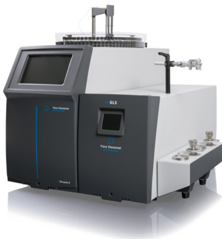
Configuration Xplorer-V with GLS