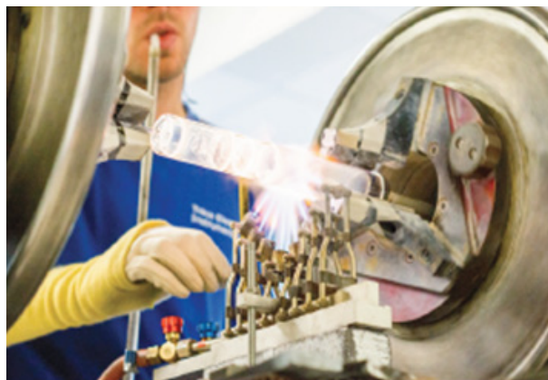
lifetime warranty on the robust dual-zone furnace

By special design and placement of the Xpro-V™, a forced collision flow heading down the tube is created. After passing the internal filter, all gases need to go up again to the exit. With this combustion setup, a longer pathway is created, forcing all the gasses to travel an extended pathlength. Due to its unique design, the Xpro-V™ combustion tube requires no consumables, such as catalysts or quartz wool. Custom introduction inlays are available for the most challenging applications. Combustion tubes and introduction inlays are easily exchanged in less than a minute without using a screwdriver.