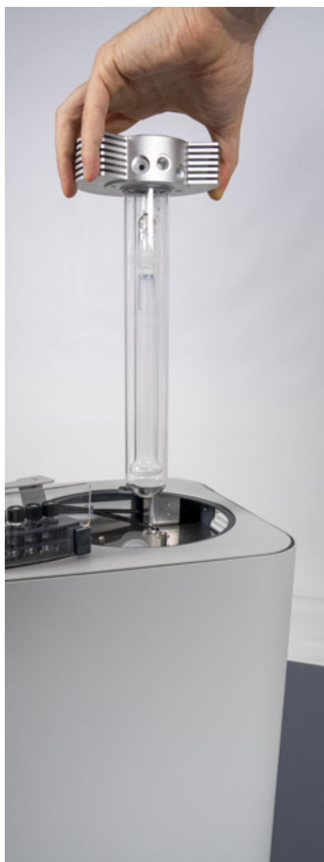
"self-cleaning" Combustion Tube Xpro-V™