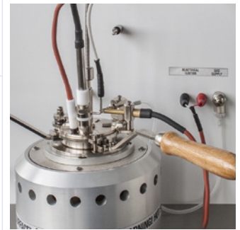
Gas with flame exposure device.