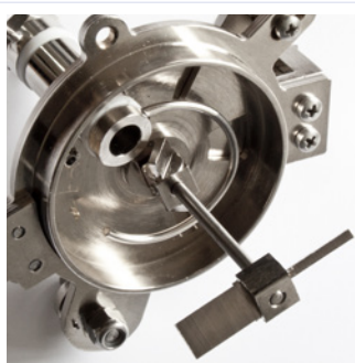
Dual flash point detection system: by ionisation ring, by thermal sensor.

The sample is heated and stirred at specified rates, using one of three defined procedures (A, B, or C). An ignition source is directed into the test cup at regular intervals with simultaneous interruption of the stirring, until a flash is detected.