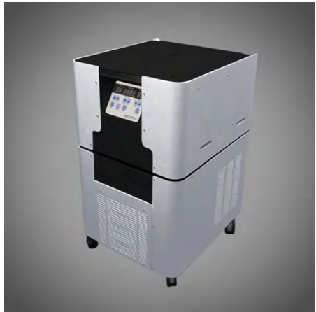
BE with trolley